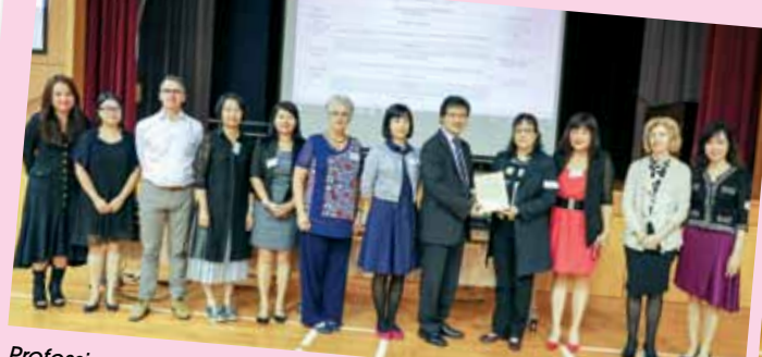
Professional Seminar for Catholic Diocese Schools Topic: Text Sets - Expand, Enrich, Invigorate English Teaching Date: 16 November, 2016 (Wednesday) Venue: St. Francis of Assisi's Caritas School

A territory-wide cluster meeting on the museum for secondary